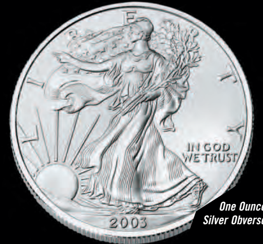
One Ounce Silver Obverse