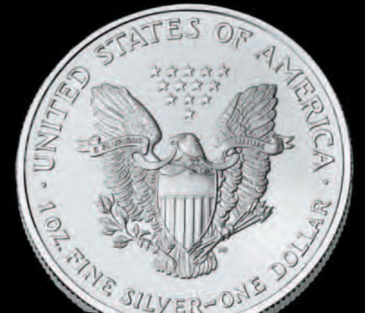
One Ounce Silver Reverse

* Balance of silver bullion consists of copper. Coins shown are not actual size.